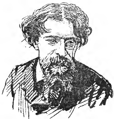
ALPHONSE DAUDET. From his last photograph.